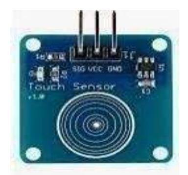
TOUCH CIRCUIT TO DETECT THE CHILD LIVE

This mechanism useful for the other applications includes Rescuing the trapped child safely from the bore well and also checks whether the child is alive by using touch circuit. It saves time with this system to rescue the child, manually monitoring also available with the help of CCTV camera system. It's also providing life supporting factors to the child.